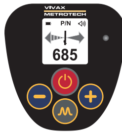
Left/Right cable location